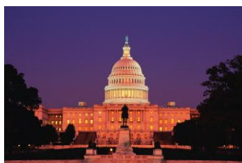
134 th INTA Annual Meeting Washington DC - May 5-9, 2012

Thank you very much and we look forward to hearing from you soon!